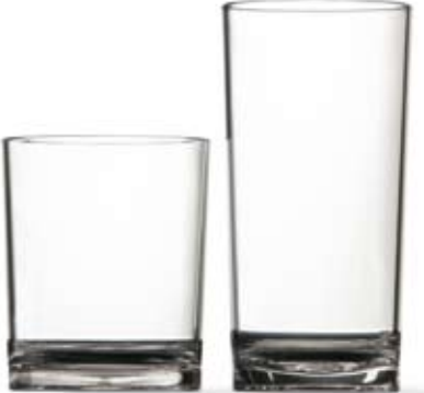
9006 14 oz. Classic DOF 9007 16 oz. Classic HB