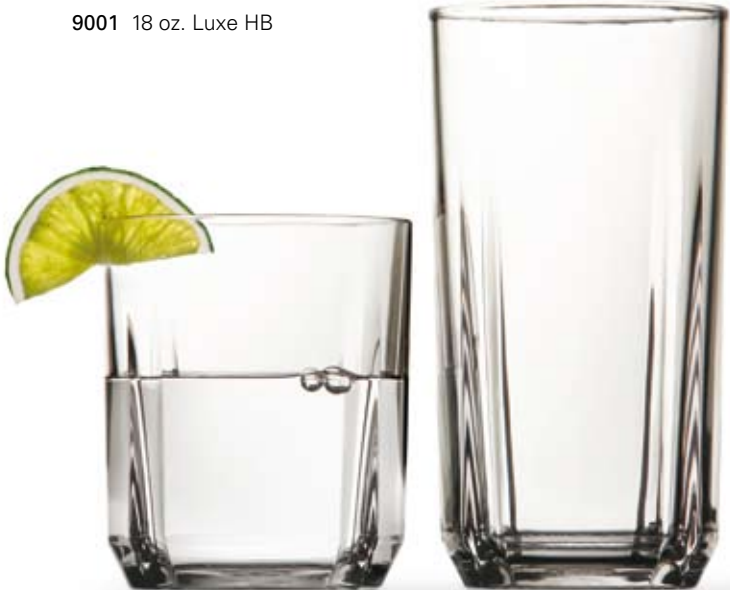
9000 14 oz. Luxe DOF 9001 18 oz. Luxe HB