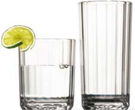
9004 14 oz. Faceted DOF 9005 16 oz. Faceted HB