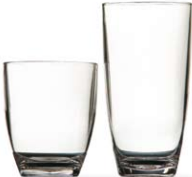
9002 12 oz. Prism DOF 9003 16 oz. Prism HB